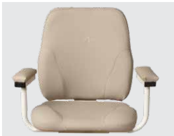
Pinnacle Premier Seat

A complete portfolio of high quality stair lifts sold through Harmar’s extensive and knowledgeable dealer network offers customers the ultimate peace of mind. All Harmar stair lifts are designed and manufactured in the USA and tested at full weight capacity before shipment. They are engineered to be quickly installed, require little to no maintenance and be easily serviced. They ship with the industry’s shortest lead times and are hand-built by our veteran manufacturing team.