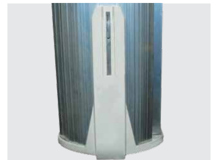
Finished end caps embed track chargers and upper / lower limit switches