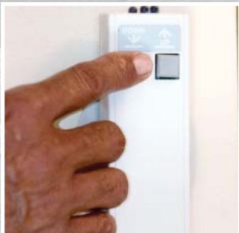
The two wireless call/send controls make installation simple and clean with no wires running along the wall.