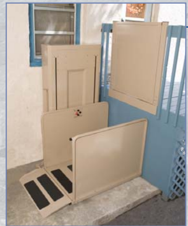
VERTICAL PLATFORM LIFT

OVER 20 DIFFERENT Vehicle Lifts INCLUDING: