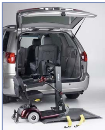
JOEY™ INTERIOR PLATFORM LIFT VSL-4000