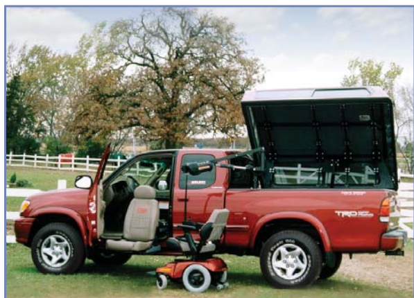
OUT-RIDER™ LIFT W/ POW'R TOPPER™ AND TURNY ORBIT PACKAGE

OVER 20 DIFFERENT Vehicle Lifts INCLUDING: