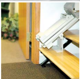
Folding rail option allows full clearance to doorways or hallways without rail obstruction.