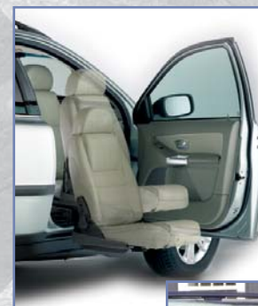
TURNY™ ORBIT® SEAT

Revolutionary Turning Automotive Seating™ (TAS™)