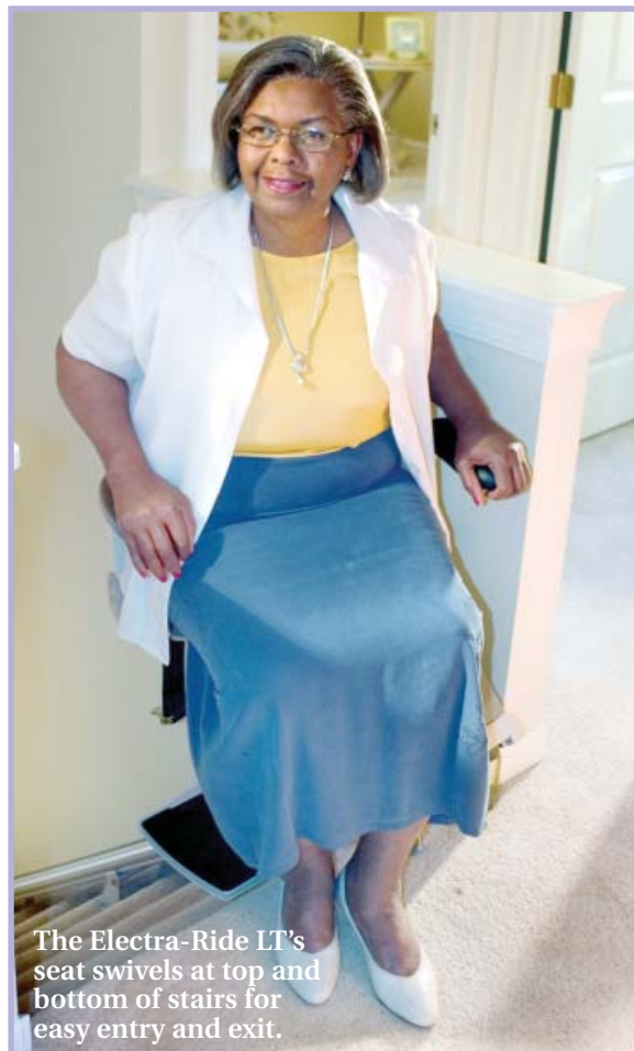
The Electra-Ride LT's seat swivels at top and bottom of stairs for easy entry and exit.