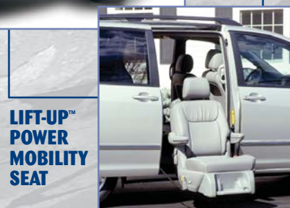
LIFT-UP™ POWER MOBILITY SEAT